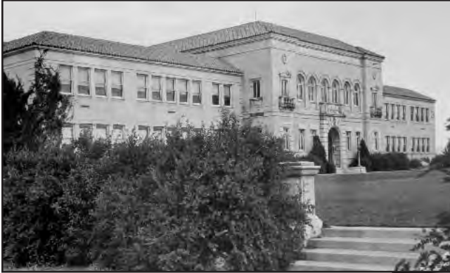
Left: EOU's historic Inlow Hall, circa 1938.

Below: A Nez Perce text inscribed on the memorial reads "Our people lived all over this Grande Ronde. They are buried here under this ground. We will never forget all the families. And now we sanctify this land."